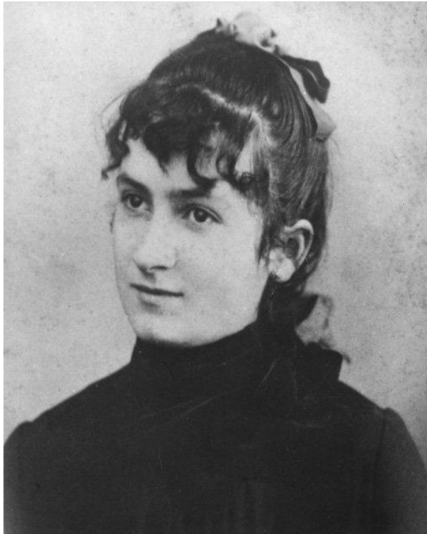
Maria Montessori (1870 – 1952)

Modern Montessori International Group (MMI) is a United Kingdom-based multinational organization widely considered as one of the world leaders within the Montessori Pre-school and Training Industry.